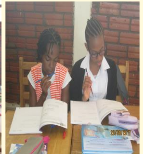
We learn in different ways, either as a class or as a group!