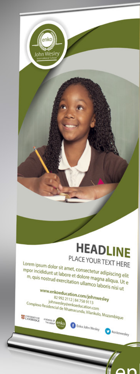
Declensions of the kakemonos according to the theme and the volume of text